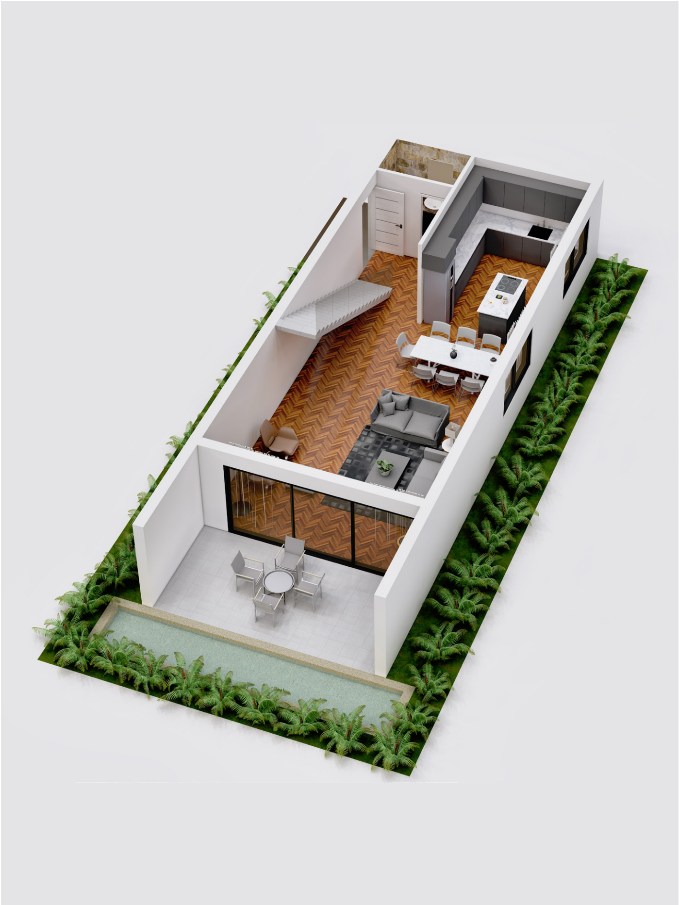
Floorplans Villa Level 01