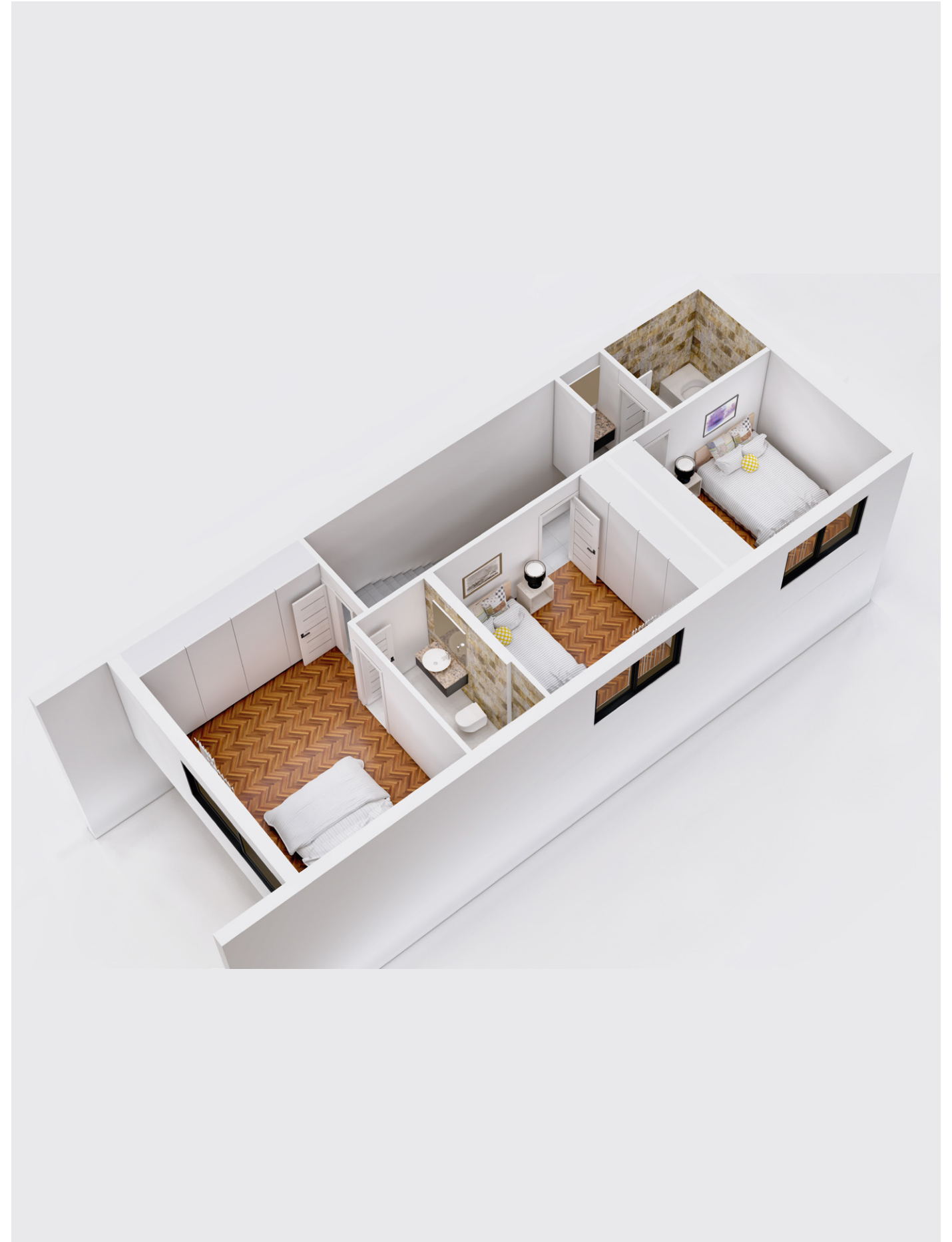
Floorplans Villa Level 02