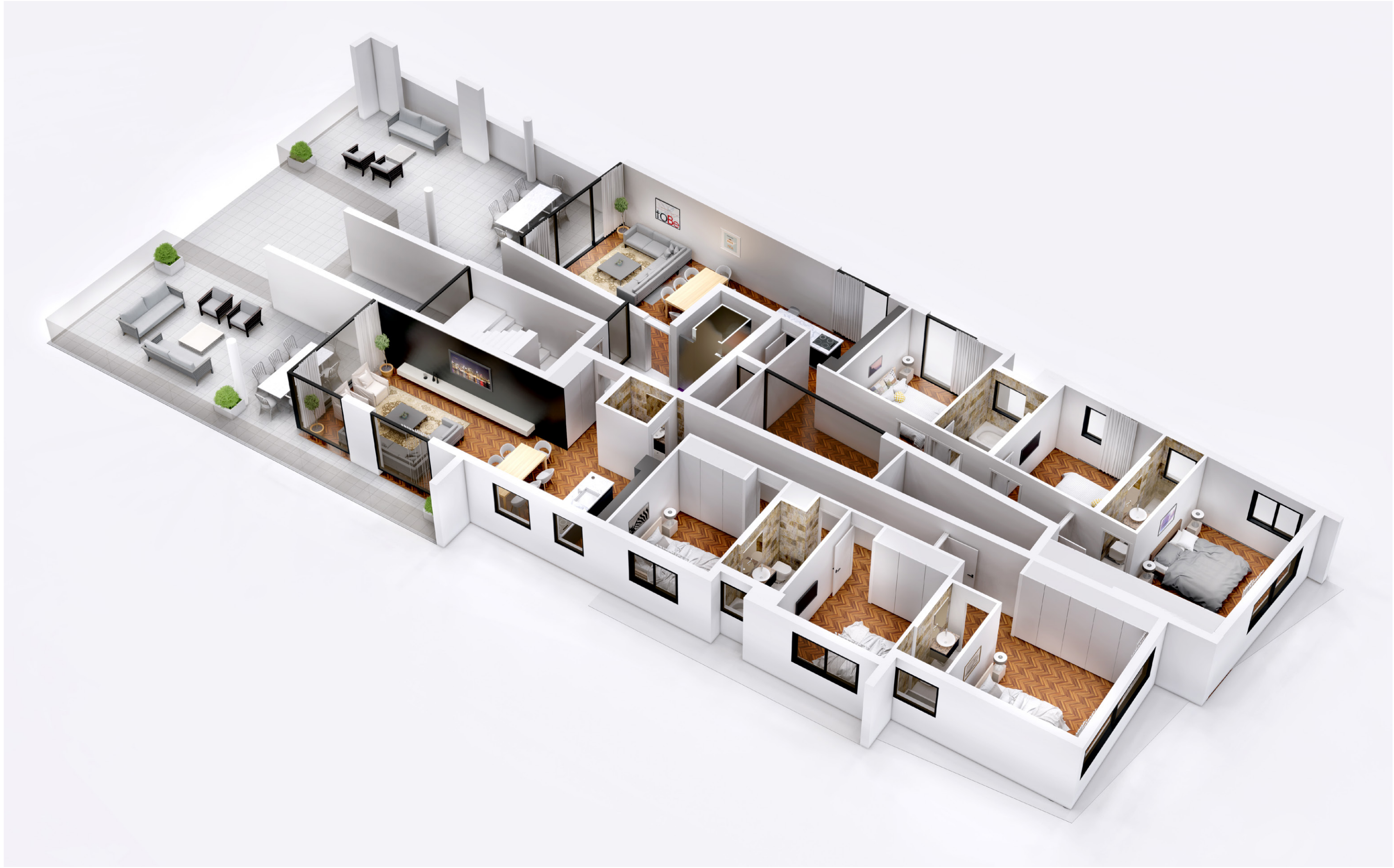
Floorplans Penthouse 301 / 302